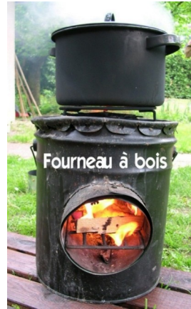
INSULATING THE FIRE AND THE HEAT